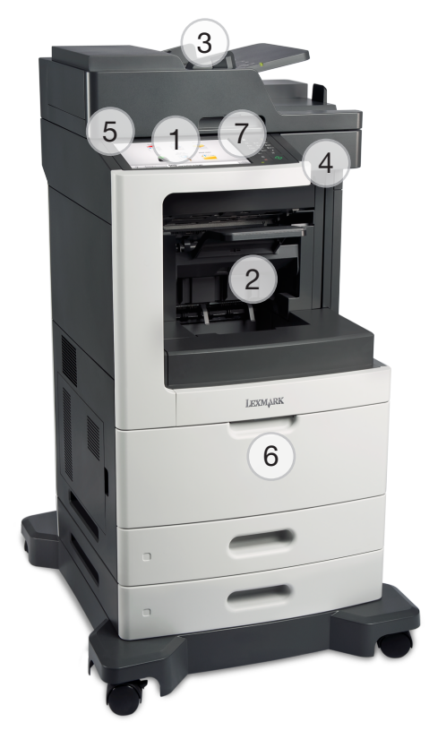
XM7170 model with Staple Finisher